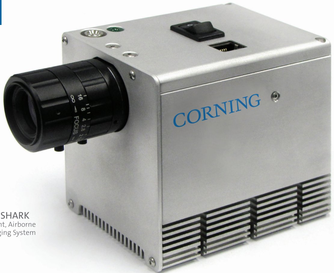
microHSI™ 410 SHARK Integrated, Coherent, Airborne Hyperspectral Imaging System

Corning Advanced Optics has developed the Corning® microHSI™ 410 SHARK (Selectable Hyperspectral Airborne Remote sensing Kit), an integrated, coherent hyperspectral imaging (HSI) sensor system designed specifically for integration with highly compact Unmanned Aerial Vehicles (UAVs), including low cost multi-rotor copters. With a weight of just 1.8 lbs., inclusive of self-contained battery, data acquisition and storage, and inertial navigation subsystem, the microHSI™ 410 SHARK enables HSI technology to be applied to a new world of applications using low-cost compact drones.