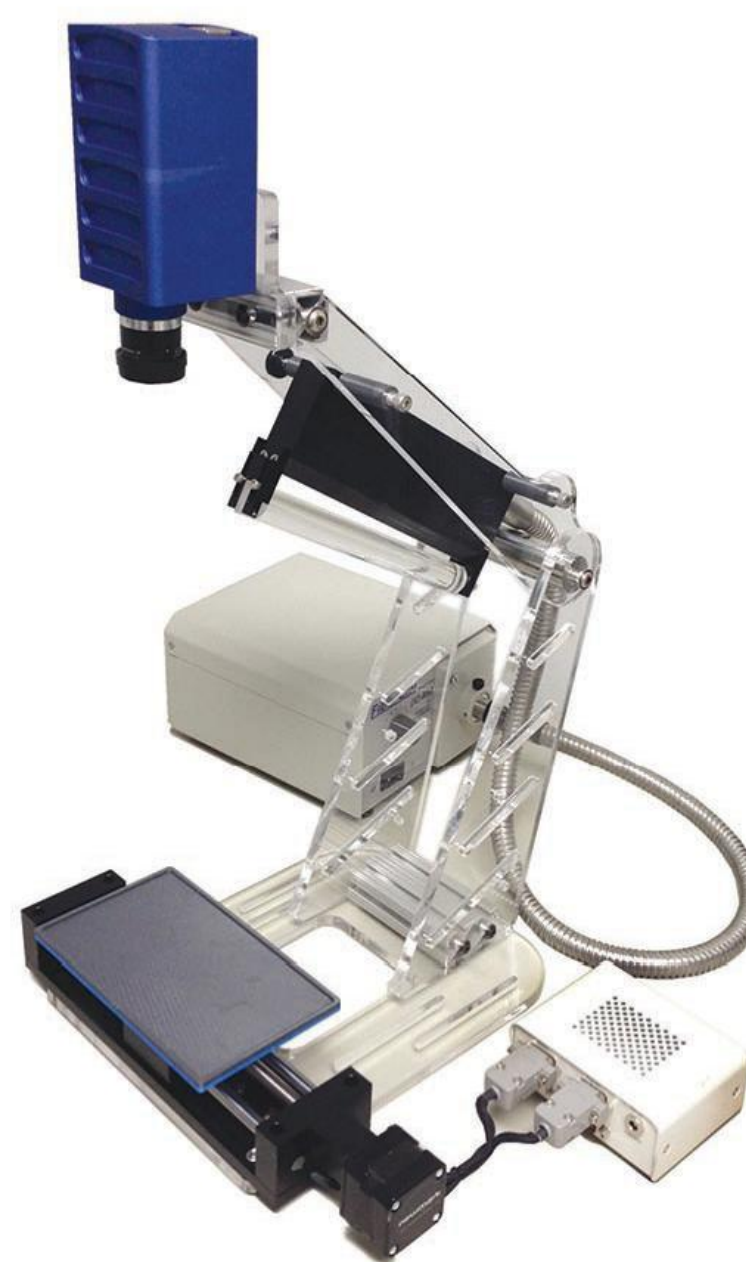
Application Development Kit

For field work Corning offers an alternative configuration. The vis-NIR sensor is fitted with an optional plug-and-play optical scan head incorporating a servo-mirror capable of acquiring complete hyperspectral data-cubes. This simplifies collection of remote sensing data from larger scenes meters to kilometers away. This stand-alone scanning sensor is controlled by HyperC+ software installed on a tablet (included) via a mini-USB (providing power).