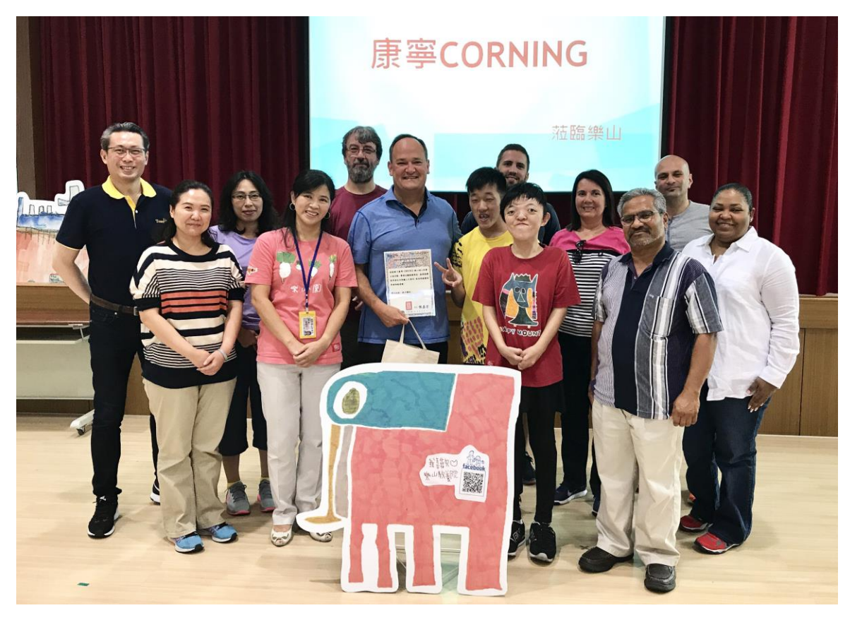
PGS is committing to a multi-year relationship with Taipei Happy Mount involving donations and follow-up service trips to the facility.

Mount. This will involve annual monetary donations, voluntary employee contributions, and visits by PGS staff for hands-on help at the facility.