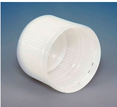
Tamper-evident screw cap