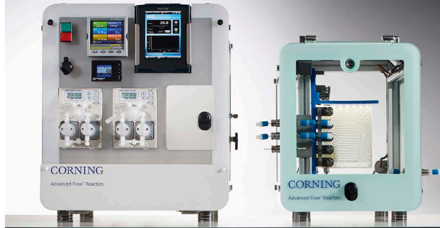
Size: 45 x 48 x 52 cm (L x W x H)