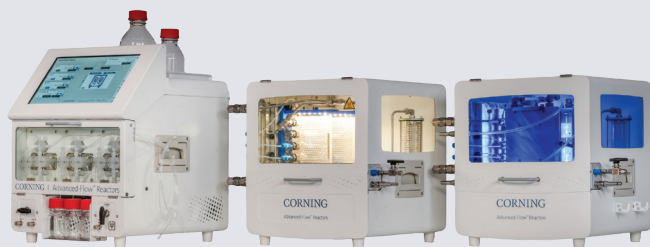
Corning Lab Reactor System 2