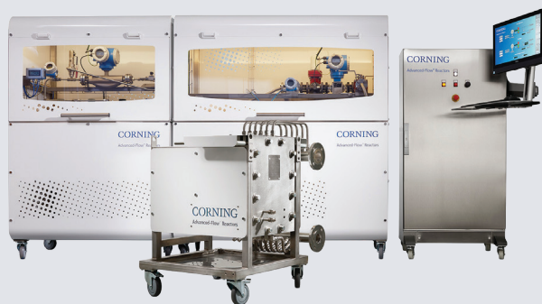
Corning G4/G5 Integrated Production System