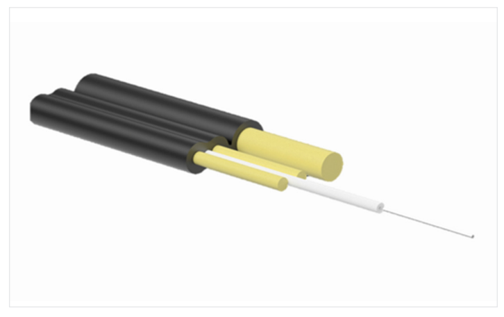
Long-Span ROC<sup>™</sup> Drop, 1 F, SMF-28° Ultra fiber, Single-mode (OS2)

Outdoor, flat cable design, dielectric only