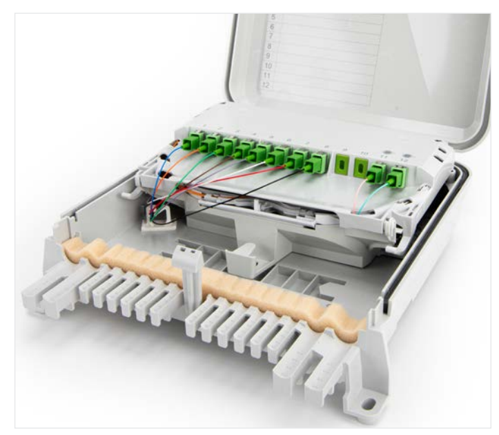
PBO12 Outdoor MDU Splitter Terminal

The PBO12 Outdoor MDU and the PBO12 Outdoor MDU Splitter Terminal are solutions which provide a rugged and low-profile interconnection point between the central office feeder fiber and the indoor/outdoor drop cables for multidwelling unit applications, all at a convenient price point. Both designs are stubless and are fully equipped to support spliced input of 1 to 12 fibers. For the distribution fibers, there is an option that includes splice trays and pigtails for splicing, or the use of field or factory-terminated cable assemblies. Available split ratios include 1x2, 1x4 and 1x8, with the option of up to two splitter devices within a single unit when 1x2 or 1x4 are selected.