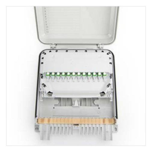
PBO12 Outdoor 12-Port MDU Terminal

When selected, a maximum of 8 additional pigtails are added based on the selected number of ports