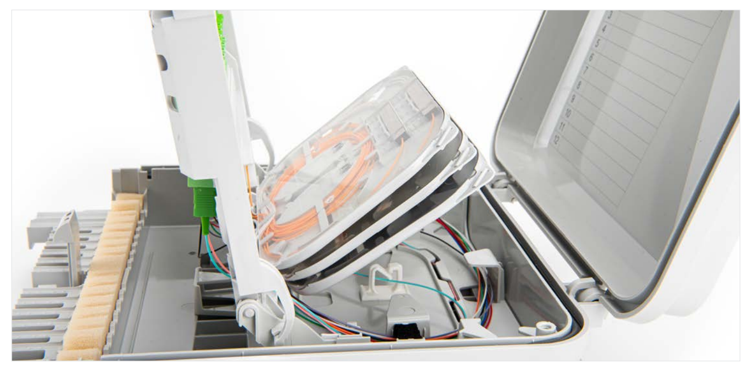
PBO12 Outdoor 8-Port MDU Splitter Terminal with Two 1x4 Splitter Devices and Spliced Distribution