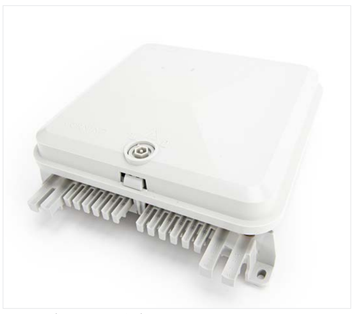
PBO12 Outdoor MDU Terminal