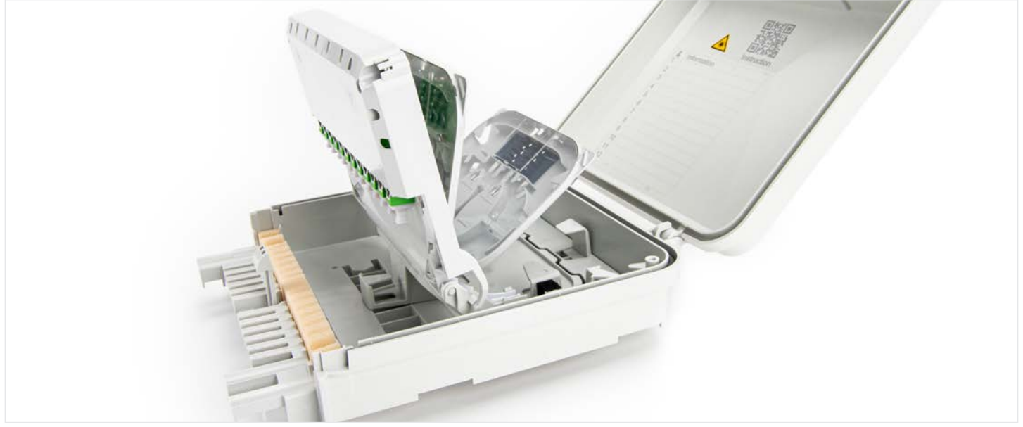
PBO12 Outdoor 12-Port MDU Terminal