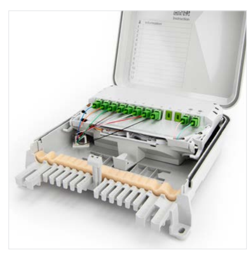
PBO12 Outdoor 8-Port MDU Splitter Terminal with Two 1x4 Splitter Devices and Spliced Distribution

*Maximum of 8 spliced distribution fibers/drops