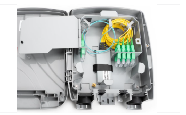
LPT Terminal with SC APC Adapter Feeder Input