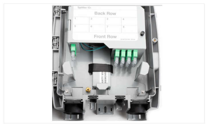
LPT Terminal with SC APC Adapter Feeder Input

The Corning low-profile distributed split terminal (LPT) is a small, simple, rugged distributed split terminal between the fiber optic distribution network and drop cables. The splitter LPT is ideally suited for multidwelling units (MDU) in a distributed split network architecture. The LPT can be shipped with a 1x4 or 1x8 splitter with an OptiTap® connector as the input connection for hardened drop connectivity. It can also use an SC APC adapter for the input connection. The terminal can be used as the S1 or the S2 splitter in the network.