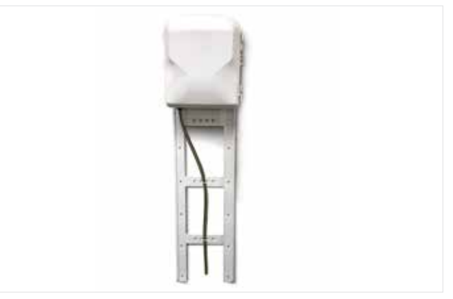
OptiSheath MDU Terminal Indoor/Outdoor Skirt