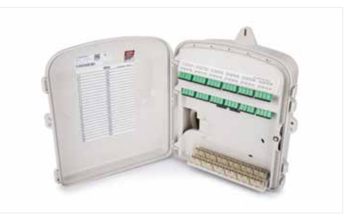
OptiSheath MDU Terminal MTP<sup>®</sup> Input Ports