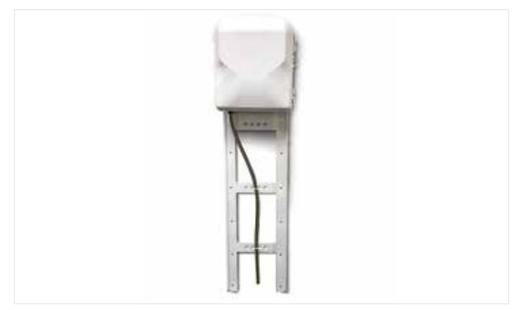
OptiSheath<sup>®</sup> MDU Terminal Indoor/Outdoor Skirt