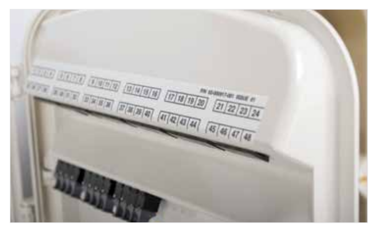
OptiSheath<sup>®</sup> MDU Terminal with MPO/MTP adapters