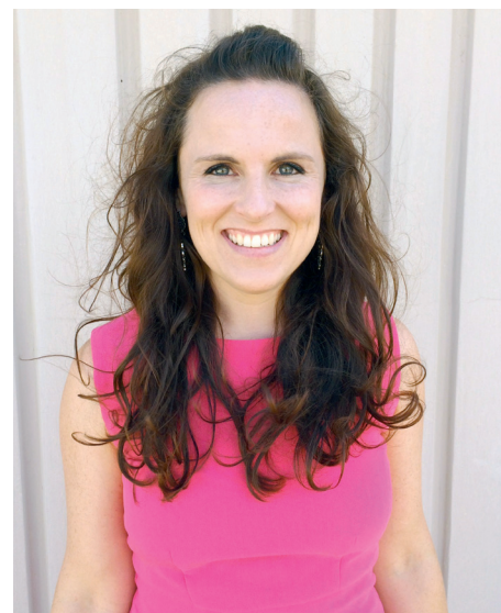
📷 Vanesa Diaz

In new deployments, microtrenching claims to reduce civil costs by 80 per cent [2] by replacing traditional trenches with a narrow slit that is sawn in the surface of the road, into which microducts with narrow, vertical cross-sections are placed. Microducts sub-divide the internal duct space into smaller compartments into which minicables are installed, allowing efficient sharing of overall duct-space and leasing of spare ducts. This technology also allows the addition of increased network capacity in the future by installing new minicables in spare microducts. In greenfield deployments, this enables a lower initial level of investment and later 'pay-as-you-go' upgrades of the network infrastructure. In brownfield networks, the smaller, lighter, and more flexible design of minicables makes them perfect to be