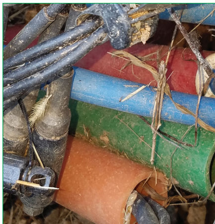
Fig. 1: With a crowded duct infrastructure it may be challenging to add further optical cable.

To enable tighter packing of fibre in the cable, the coating diameter of the new generation of single-mode fibres has been reduced from 250\ \mu\text{m} to 200\ \mu\text{m} , while still retaining the same 125\ \mu\text{m} cladding diameter of conventional single-mode fibres (see Fig. 3). Reduced cushioning of external stresses by the thinner coating could lead to more microbend losses in a 200\ \mu\text{m} fibre, so a G.657 compliant glass design is employed as this tends to deliver both superior macrobend performance and enhanced microbend resistance to the product. Further, the use of superior coating technology provides excellent resistance to microbend inducing external stresses even when applied at the