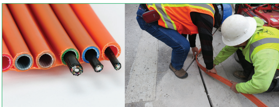
Fig. 2: A linear microduct may be installed in a microtrench that can be cut much more cheaply and quickly than a traditional trench. (Image on right courtesy of Dura-Line).

In new deployments, microtrenching claims to reduce civil costs by 80% [1]. Instead of digging a traditional trench, a narrow slit is sawn into the surface of the road and populated with microducts of narrow cross-