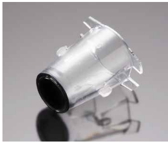
Corning FluoroBlok 6.5 mm insert