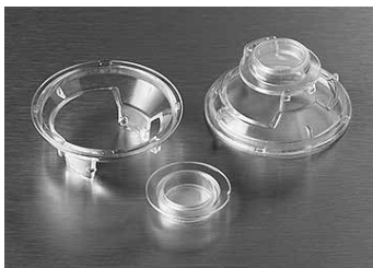
Polyester Snapwell inserts