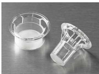
24 and 6.5 mm Transwell inserts