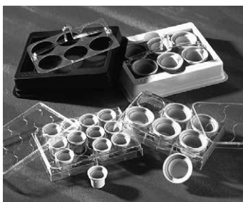
Polyester Netwell inserts