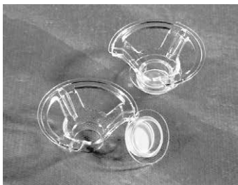
Polycarbonate Snapwell inserts