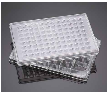
Falcon HTS insert plates