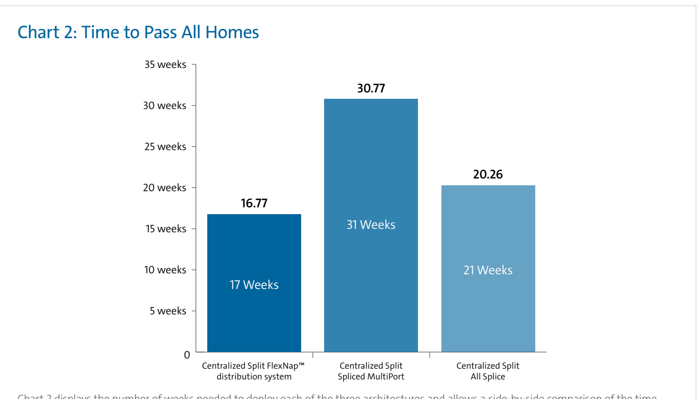
Chart 2 displays the number of weeks needed to deploy each of the three architectures and allows a side-by-side comparison of the time to pass the target number of homes.