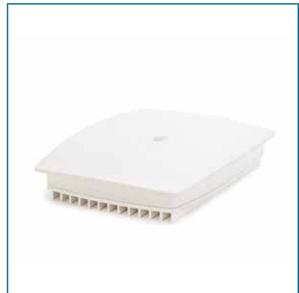
SCRN-310 | Figure 1

As the demand for mobile broadband accelerates, mobile network operators need to efficiently utilize both UMTS and LTE technologies, without creating new network complexity. The SpiderCloud® scalable small-cell system, called an enterprise radio access network (E-RAN), hides the complexity of radio management and mobility and provides operators with a single touchpoint to aggregate and manage a large network of UMTS, LTE, and multiaccess (UMTS and LTE) small cells.