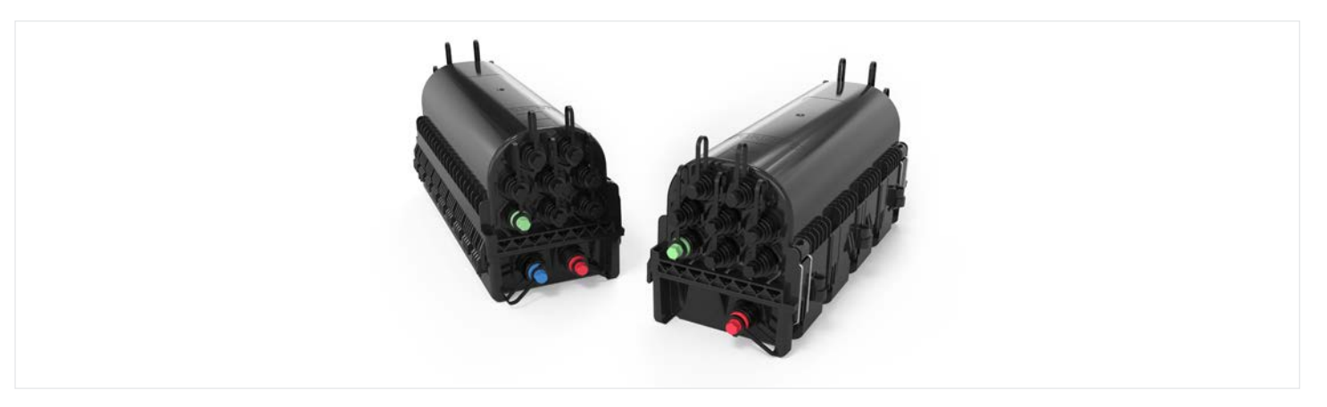
UCAO Multiport 17- and 18-port Terminals

The BPEO CT Multiport 17-port terminal has one standard 1x16 splitter to support customer connections, designed to be used as the last terminal of the chain.