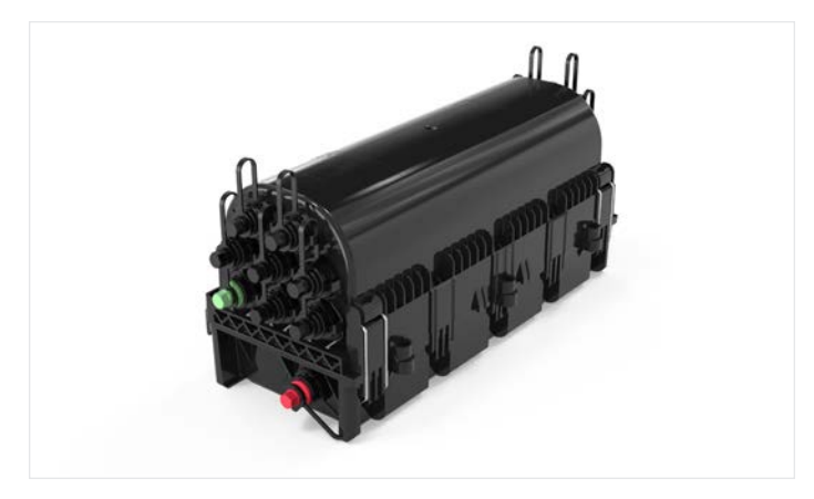
UCAO Multiport Terminal 17 ports