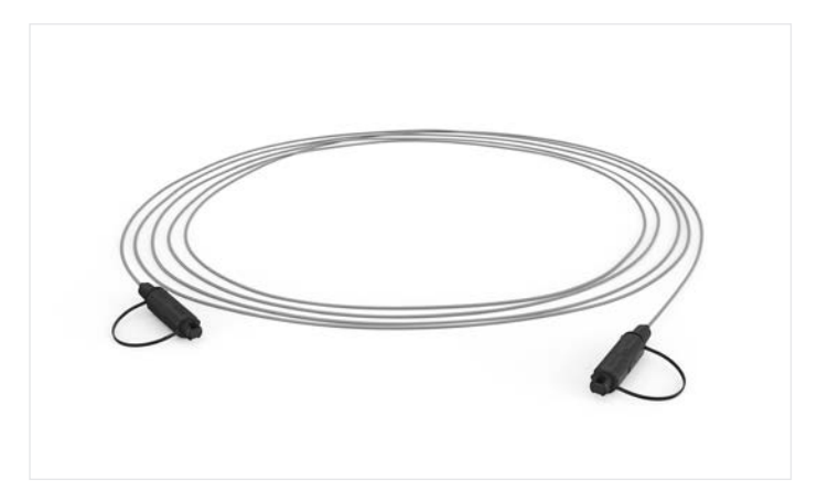
Figure-8 Low-Friction OptiTap® Jumper Assembly

As an industry leader in optical connectivity products, Corning designs and manufactures the low-friction figure-8 drop cable assembly with factory-terminated, environmentally sealed and hardened connectors to reduce the cost and time of drop cable deployment. Corning OptiTap® connector design provides superior durability and reliability in the drop segment of the network. This new assembly also offers significant improvements in cable management.