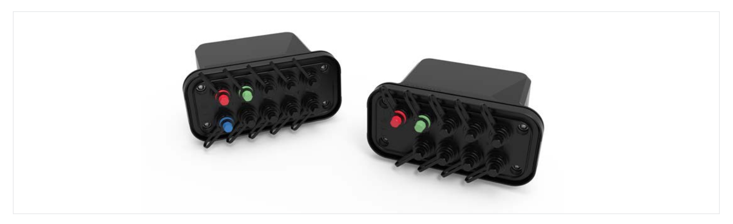
BPEO CT Multiport 9- and 10-port Terminals

The BPEO CT Multiport 9-port terminal has one standard 1x8 splitter to support customer connections, designed to be used as the last terminal of the chain.