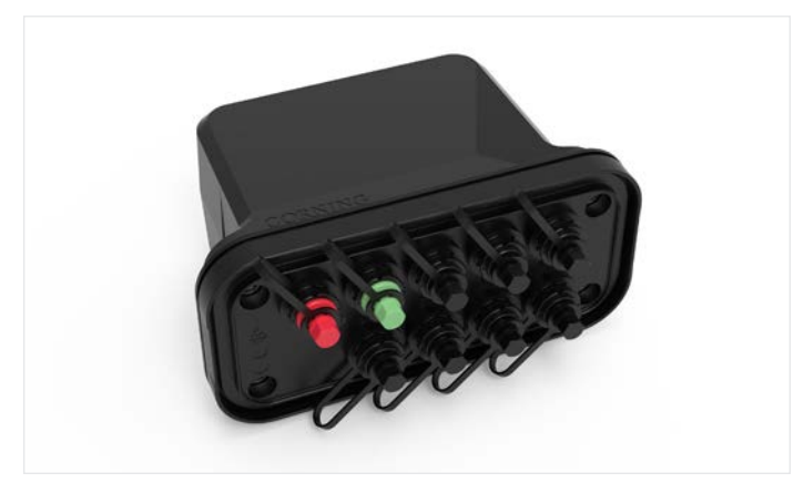
BPEO CT Multiport Terminal 9 ports