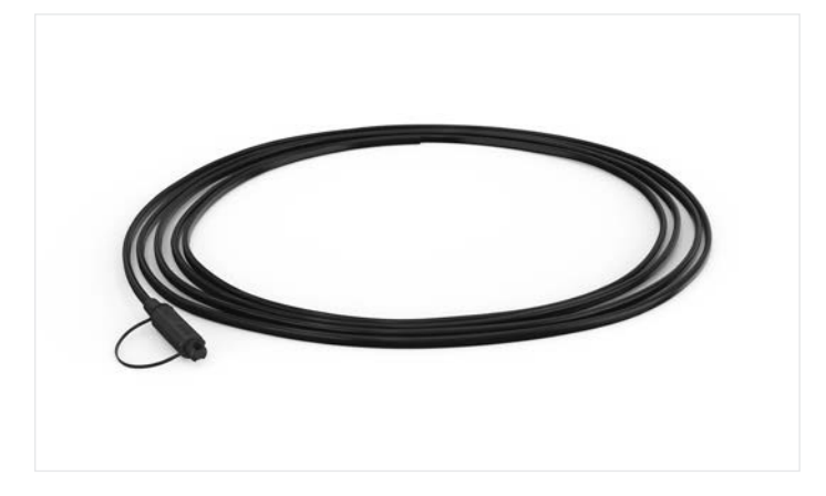
OptiTap® ROC™ Drop Jumper Assembly