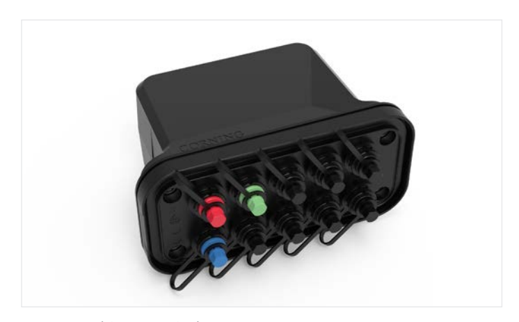
BPEO CT Multiport Terminal 10 ports