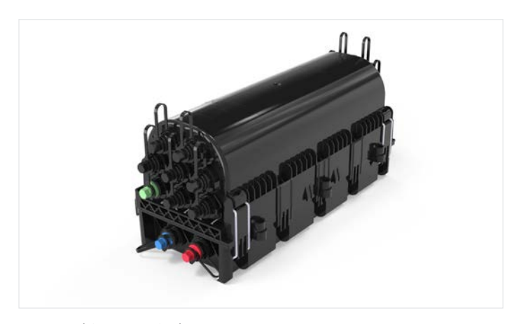
UCAO Multiport Terminal 18 ports