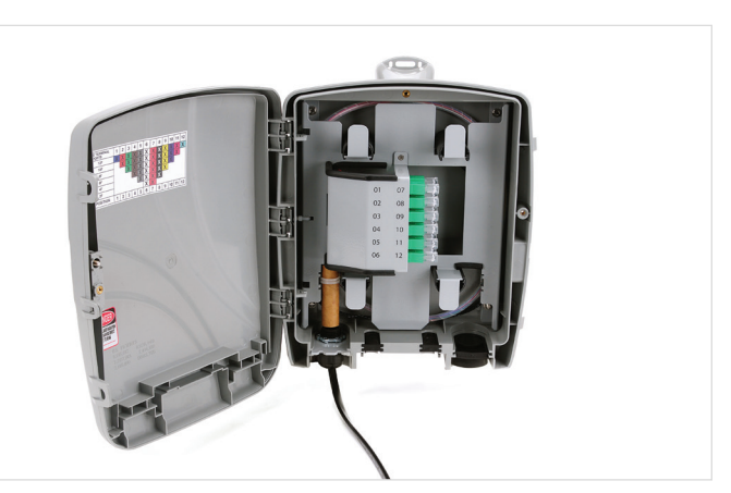
Low-Profile MDU Housing with OptiTip Connectorized Cable Stub