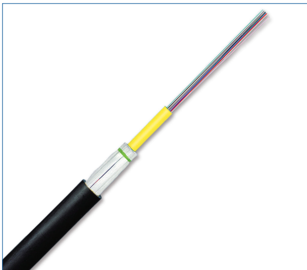
A-DQ(BN)2Y Central Tube OS2

Approval and Listings Telcordia (Bellcore) colour standard for fibres and tubes