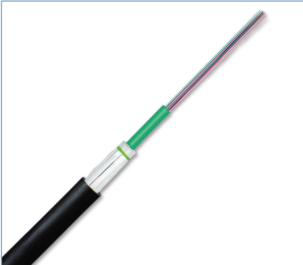
A-DQ(BN)2Y Central Tube OM2/OM3/OM4