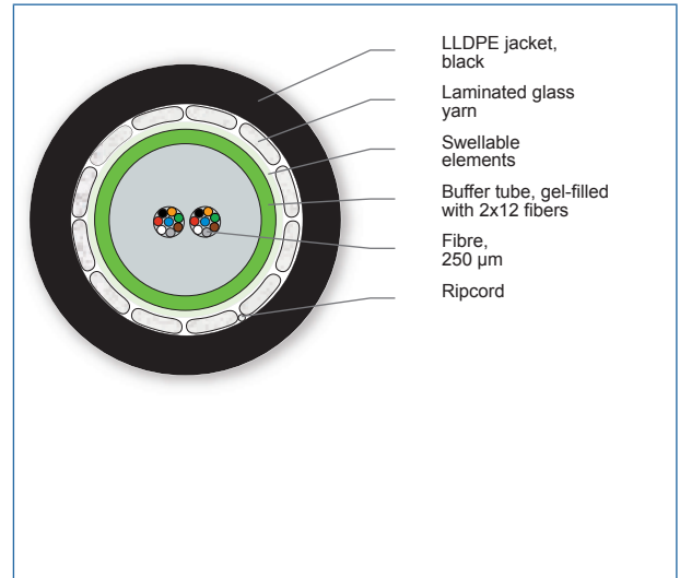
A-DQ(BN)2Y 1x24G50CC OM4/125 CT