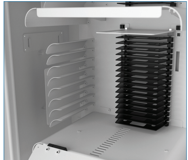
Optical Splice Enclosure OSE-HD0 Lower Splice Organizer | Photo CRR3455