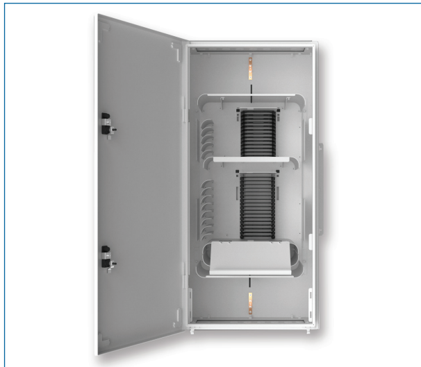
Optical Splice Enclosure OSE-HD0 | Photo CRR3457

Each universal OSE features a full range of capabilities for wall 23-in rack and T-slot mounting. The T-slot mounting hardware allows for both horizontal and vertical mounting and enables tight, side-by-side mounting arrangements. In addition, universal OSEs are especially well-suited for installations that require preconnectorized cable assemblies or stubbed optical patch panels. In these installations, the Universal OSE can actually replace the rack-mounted splice unit typically required.