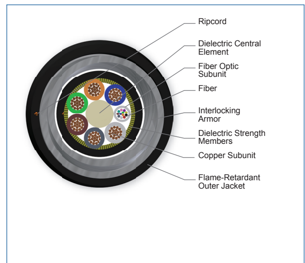
ActiFi™ Composite Cable, Interlocking Armored, Indoor/Outdoor Riser, 12-Fibers