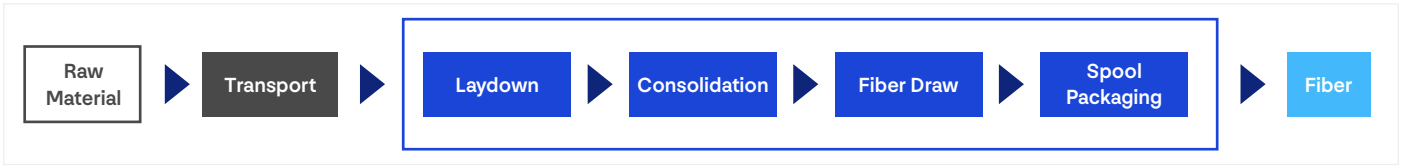
Figure 3. Process flow of the significant manufacturing stages of the optical fiber

No special end-of-life treatment is required. The assumption made for the end-of-life scenario for the product is 100% landfill.