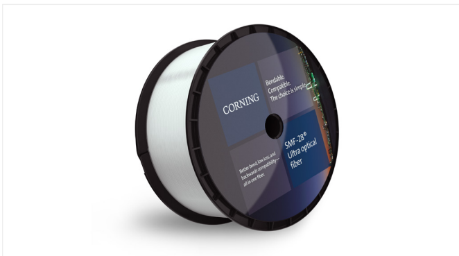
Figure 1. Corning SMF-28 Ultra Optical Fiber

This fiber combines industry-leading attenuation, macrobend performance that exceeds ITU-T Recommendation G.657.A1, and a 9.2 µm mode field diameter. This fiber is designed for carrier (access, mobile, FTTH) and data center (indoors, DCI) applications and is fully backward compatible with the installed base of legacy single-mode fibers. The traditional 242 µm diameter is the maximum diameter in the product family portfolio and has been chosen to be the reference product for the definition of the Life Cycle Impact Assessment Results.