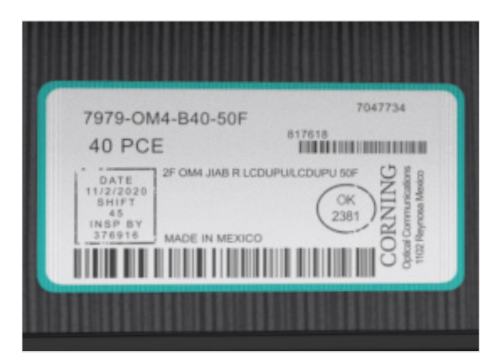
Part number identification at a glance

Self-tracking inventory count on each bag