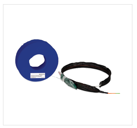
Clear Track 12-Fiber Micro-Module Spool Connectorized with SC APC Connectors and Pulling Grip