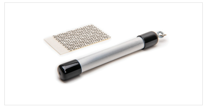
Clear Track Wall Compatibility Test Weight and Strips