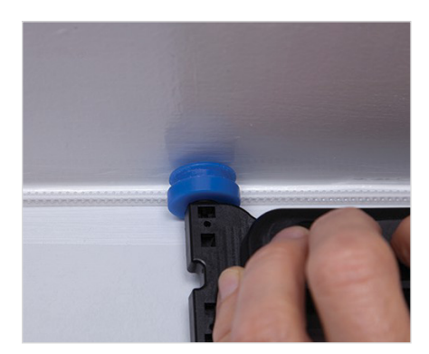
Installation of Clear Track Hallway Fiber Pathway with Hallway Installation Tool

The Clear Track Fiber Micro-Module can be easily laid and captured within the Clear Track Hallway Fiber Pathway with the Clear Track Hallway Fiber Installation Tool. The flexible, continuous Clear Track Hallway Fiber Pathway can be easily routed around corners as well as curved or irregular surfaces, without any accessories or corner pieces. The unique fiber restraints and conformable adhesive help capture and provide durability to the fiber.