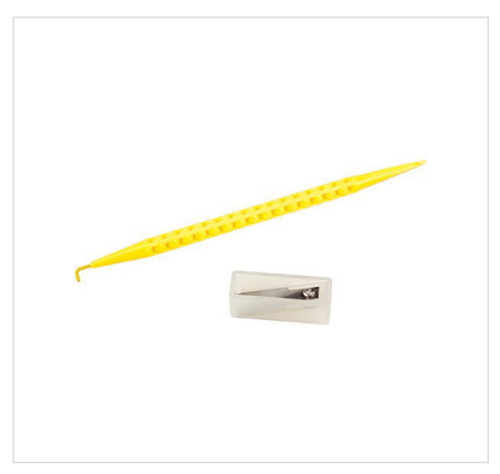
Clear Track Hallway Fiber Access Toolkit