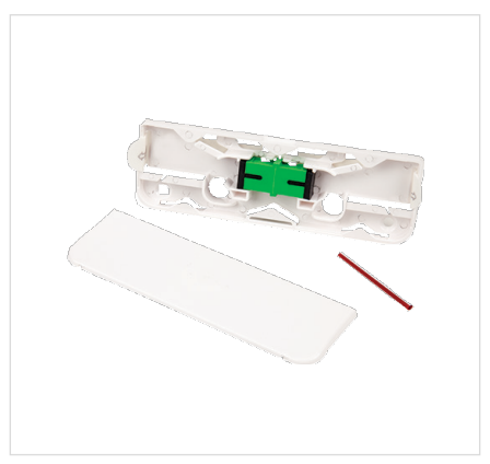
Clear Track Hallway Small Point-of-Entry Box with Command™ Adhesive Strips