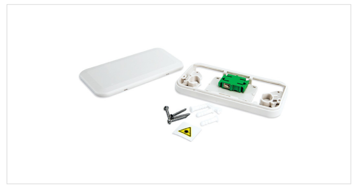
Hallway POE (Point of Entry) Equipped with Duplex SC APC Adapter