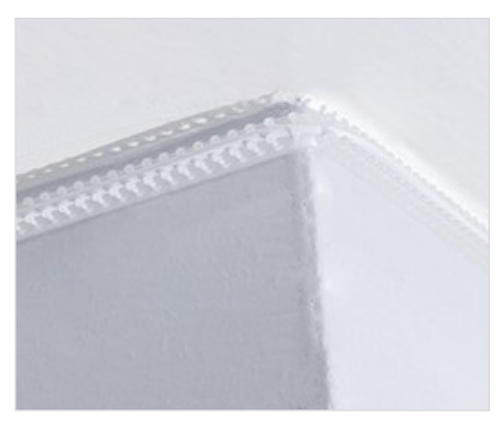
Clear Track Hallway Fiber Pathway Installed Around Exterior Corner