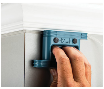
Installation of Hallway Fiber Pathway with Clear Track Hallway Universal Installation Tool