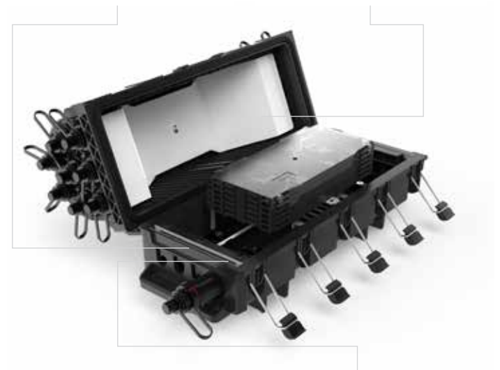
100% grommet-based sealing system, including the uncut cable