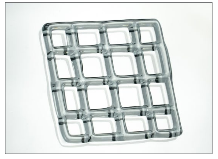
Figure 2. Three-layered grid structures acquired after printing with Corning Start sacrificial ink using the parameters from Table 2.