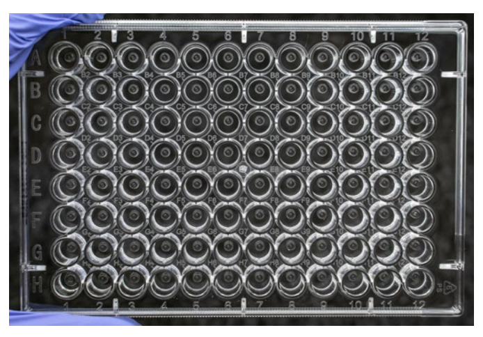
Figure 1. Droplets of Corning Pluronics sacrificial ink without cells dispensed in a 96-well microplate, using the parameters in Table 1.