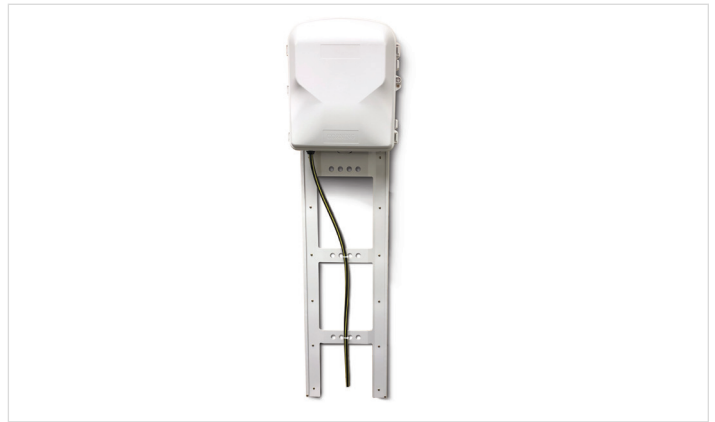
OptiSheath MDU Terminal Mounting Bracket

The indoor/outdoor protective skirt kit allows the removal and installation of the skirt without tools after initial installation. The cavity created by the skirt and mounting bracket features allows both cable management and storage for the incoming and drop cables.