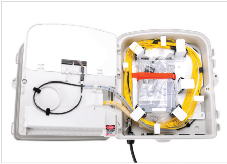
Stubbed MDU Terminal | Photo CRR822