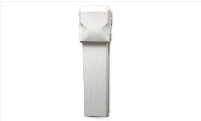
OptiSheath MDU Terminal Indoor/Outdoor Skirt