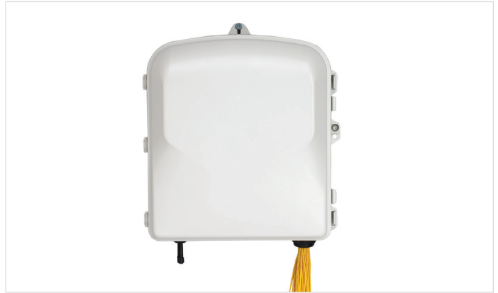
OptiSheath MDU Terminal (Closed)

The OptiSheath® MDU terminal is a rugged, indoor/outdoor low-profile interconnect between the distribution network and indoor/outdoor drop cables for multidwelling unit applications. Compatible with loose tube and ribbon cables, the terminal also accommodates Corning® ClearCurve® rugged drop cables.