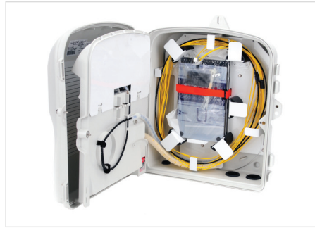
Stubless MDU Terminal | Photo CRR821