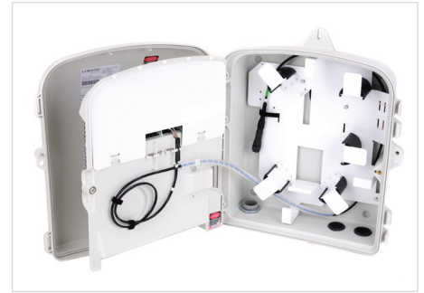
MDU Terminal – OptiTap® Connectors | Photo CRR820