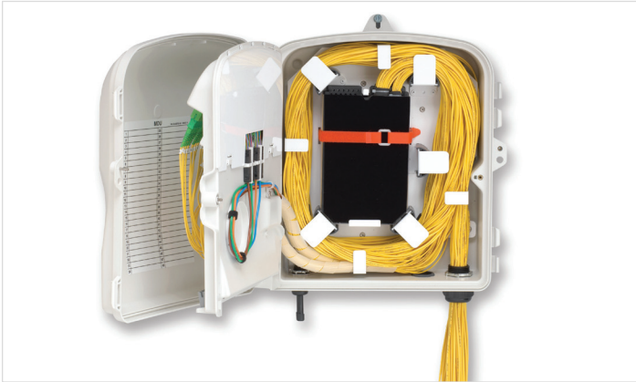
OptiSheath MDU Terminal Splice Compartment