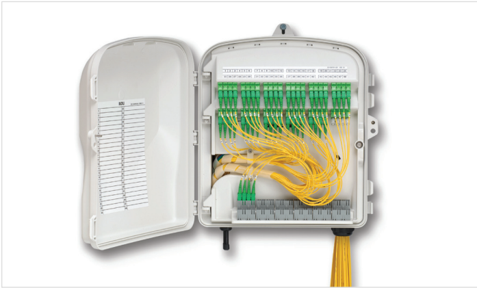
OptiSheath MDU Terminal (Open)