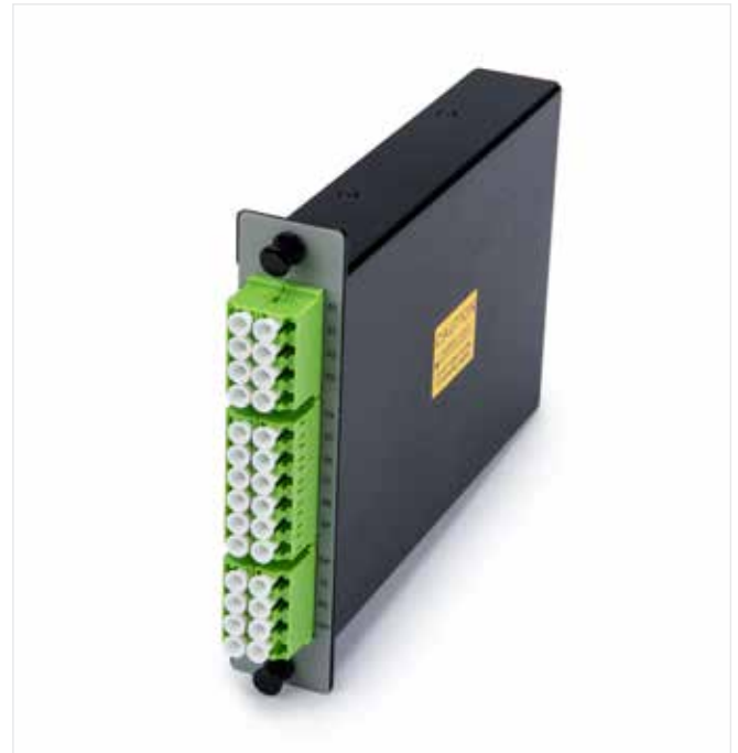
Part Number: DKXB31A202000ZZB50

Corning offers a variety of DWDM modules compatible with the LDC family connector housings. Components are compliant to Telcordia requirements, including GR-1209, GR-1221, and others as appropriate to the specification. The modules are routed directly to the LDC family housing.