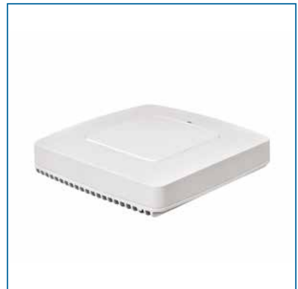
SCRN-330 | Figure 1

The SCRN-330 is an LTE-TDD small cell with self-organizing network (SON) capability. The SpiderCloud® enterprise radio access network (E-RAN) is part of the scalable small cell system. E-RAN hides the complexity of radio management and mobility and provides operators with a single touchpoint to aggregate and manage a large network of small cells.