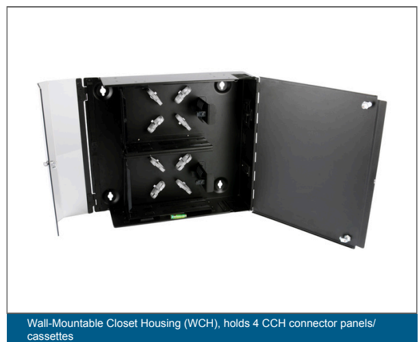
Wall-Mountable Closet Housing (WCH), holds 4 CCH connector panels/cassettes