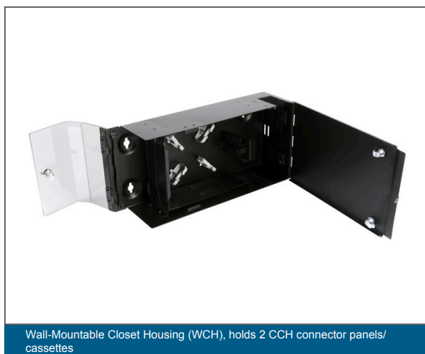
Wall-Mountable Closet Housing (WCH), holds 2 CCH connector panels/cassettes