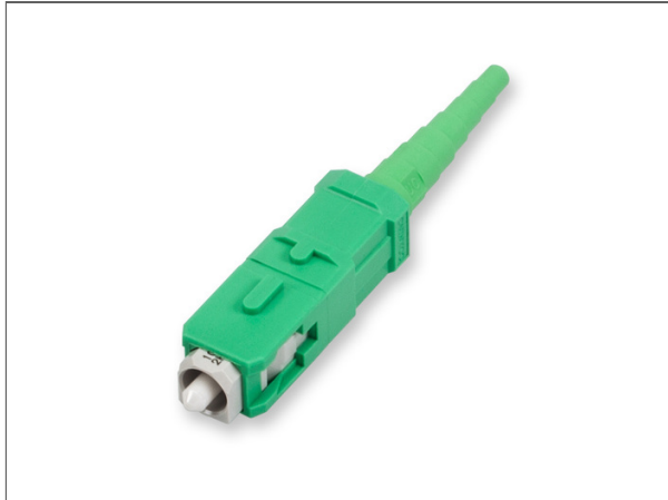
UniCam® High-Performance Connector, SC APC, Single-mode (OS2)