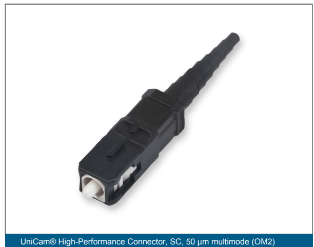
UniCam® High-Performance Connector, SC, 50 µm multimode (OM2)