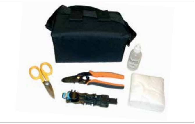
No Polish Connector Kit with CI-01 Cleaver (8865-C)

No Polish Connector Kit without cleaver (8865)