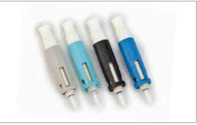
No Polish LC Connector Family