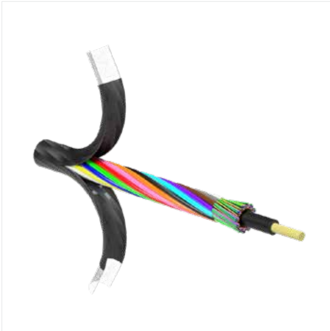
Part Number: 288ZH4-Y3C49A20