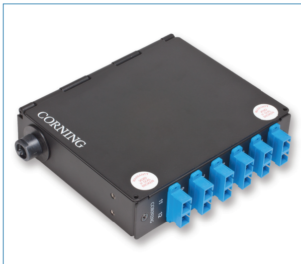
Integrated Single-Panel Housing (closed) | Photo LAN1643

Corning Integrated single-panel housing utilizes the OptiTip® adapter with the small-profile single-panel housing for quick and easy deployment eliminating the need for field-terminated and strain-relieved fiber optic cables. The housing is ideal for star, ring, point-to-point, or zone architectures. Factory-terminated panels provide industry-leading quality and reliability while eliminating the time required for field-termination methods and the need for specialized field-termination tools, training, and specially prepared locations. The compact unit is ideal for use inside NEMA- and IP rated enclosures and other environments where space is a premium.