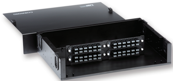
Fiber Zone Box (shown with 24-fiber LC duplex adapter CCH panels) | Photo LAN1465