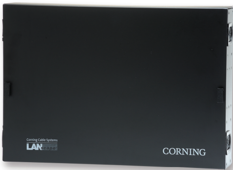
Fiber Zone Box (FZB-04P) | Photo LAN1408

Corning fiber zone box (FZB-04P) is a smaller alternative to the flagship FZB-04U. Ideal for installations up to 96 fibers, the FZB-04P manages four CCH panels or Plug & Play™ systems modules. The FZB-04P can be mounted vertically or horizontally. When mounted vertically, the adapter plane of the panels or modules faces up toward the installer. This creative design element significantly increases the installer's and end user's ease-of-use for initial installation as well as moves, adds and changes. Strain-relief is an important aspect of all housings, particularly when placed in a sub-floor environment. The FZB-04P comes equipped with integrated strain-relief for Corning Plug & Play systems trunk plugs as well as the universal cable clamp (UCC) for standard installations. From installation to daily maintenance, the FZB015004P is a convenient, easy-to-use product designed with the installer in mind.