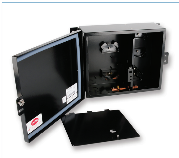
Industrial Connector Housing, ICH-02P (open) | Photo LAN7385

The housings are designed to accommodate conduit with concentric knockouts and accept standard CCH connector panels and modules. Splicing is accomplished with the splice tray holding kit that may be ordered separately. The units have a padlock outer door and a separate inner door to protect the provider side of the unit from unauthorized access. The inner door may also be locked by using an optional key lock.