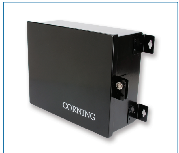
Industrial Connector Housing, ICH-02P (closed) | Photo LAN7407