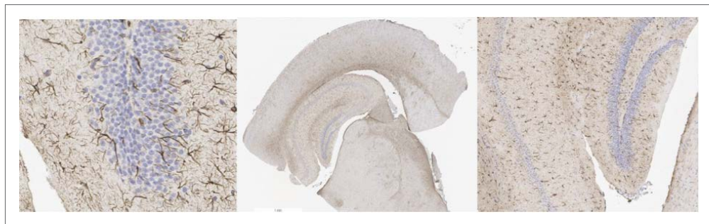
Figure 1C. Mouse brain tissue was cleared using the Corning 3D Clear tissue clearing technique. Cleared tissue was then reversed, embedded in paraffin, sectioned, and immunostained for GFP, labeling astrocytes. The Corning 3D Clear tissue clearing workflow does not affect antigenicity of tissues.