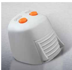
Battery cover with wings