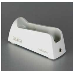
3 position charging stand