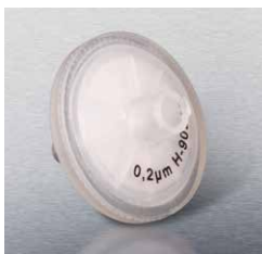
Hydrophobic PTFE filters