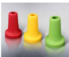
Extra nose pieces