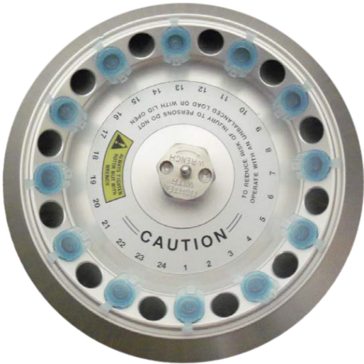
Figure 1. Loading the rotor to achieve balance.

Tubes to be loaded should be filled equally by eye. The difference in the weight between the tubes should not exceed 0.1 gram. Tubes should always be loaded so that there is equal spacing between all tubes. One or two additional loaded tubes may need to be added to achieve this. Refer to Figure 1 to see one typical balancing scheme.