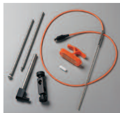
Hot Plate Accessories