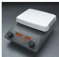
Model PC-420D shown

†Bosshead clamps to support rod, holding rod connects to bosshead. Temperature controller slides into holding rod.