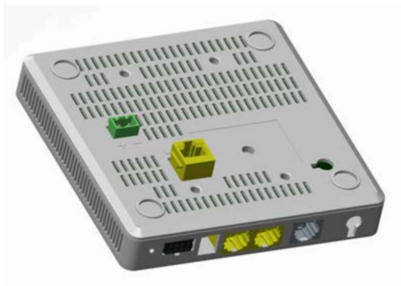
Model 1LAN-ONT-8293 Rear View showing 3 rd Ethernet port and power connection from the backside of the unit