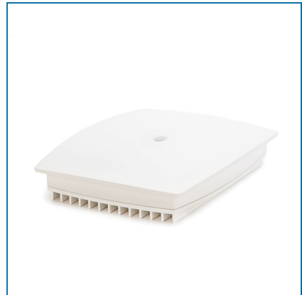
SCRN-310 | Figure 1

As the demand for mobile broadband accelerates, mobile network operators need to efficiently utilize both UMTS and LTE technologies, without creating new network complexity. The SpiderCloud® scalable small-cell system, called an enterprise radio access network (E-RAN), hides the complexity of radio management and mobility and provides operators with a single touchpoint to aggregate and manage a large network of UMTS, LTE, and multiaccess (UMTS and LTE) small cells.