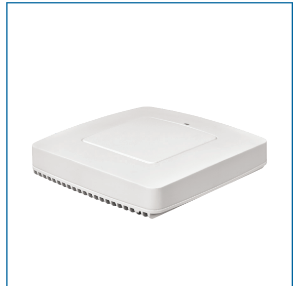
SCRN-320 | Figure 1

The SpiderCloud® scalable small-cell system, called an enterprise radio access network (E-RAN), hides the complexity of radio management and mobility and provides operators with a single touchpoint to aggregate and manage a large network of small cells. The SCRN-320 builds upon the LTE-advanced functionalities of the E-RAN system and leverages CA and self-organizing networks (SON) capabilities to support LTE-U and LTE-LAA operation.