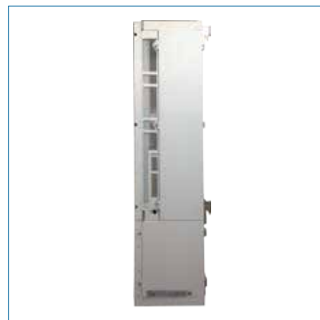
GX Quad-Band Unit | Figure 1

GX high-power remote compliments both the Corning® optical network evolution (ONE™) solution and the MA1000/MA2000 platform, sharing a common equipment headend and element management system (EMS) with the other lower-power remotes. GX remotes offer high RF power coverage capabilities with compact design for added spaces savings and weather-resistant enclosures to fit various site needs.