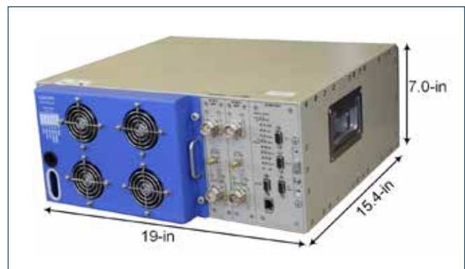
HX WCS Remote Unit | Figure 1

HX provides a comprehensive indoor coverage solution for varying site requirements, supporting everything from high-rise buildings and campus topologies to stadiums and airports. HX MIMO takes full advantage of MIMO technology by using spatial multiplexing to deliver higher spectral efficiency and preventing the degradation of quality while significantly increasing throughput on the same spectrum.