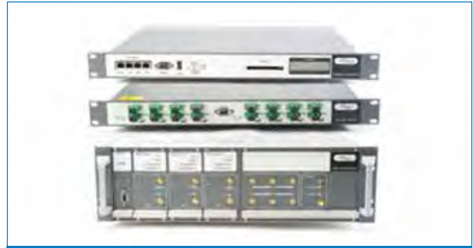
Headend: System Controller, Base Unit, RIU | Figure 2

The MobileAccessHX Remote Unit (indoor-SISO/MIMO and outdoor-SISO models) consists of a compact enclosure housing the RF module, power elements and required interfaces. The RF module supports three bands (GSM, DCS and UMTS) and two types of quad bands (Type 1: LTE700, CELL, PCS and AWS or Type 2: CELL, EGSM, DCS and UMTS). All mobile services are combined and distributed through a single antenna port over antennas installed at the remote locations.