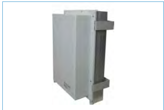
Remote-end: Outdoor | Figure 4