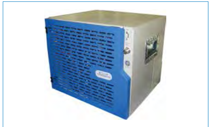
Remote-end Indoor Units: SISO/MIMO | Figure 3