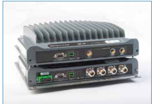
MA 1000 Tri-Service Package | Figure 4