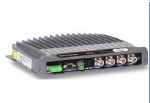
RHU | Figure 6