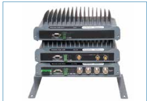
MA1000 Quad-Service Package | Figure 5