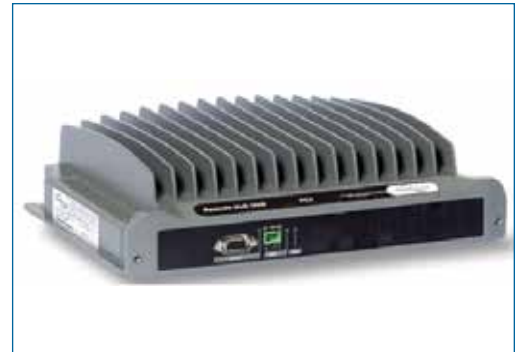
Add-On Module | Figure 7w