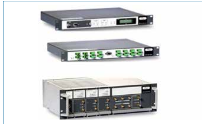
Typical Headend Equipment: SC-450 (Top), Base Unit (Middle), and RIU (Bottom) | Figure 1

Tri-Service Package (TSX): The MA1000 TSX offers a simple and cost-effective method for delivering a dedicated single carrier, three RF service deployment across a common fiber/coax antenna infrastructure. It consists of a single RHU and an Add-on mounted on a bracket.