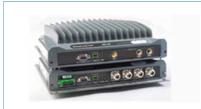
Typical Remote-End Equipment Add-On (Top) and RHU (Bottom) | Figure 2

Remote Hub Unit (RHU): The RHU is a service-specific module that performs optical to RF conversion on signals received from the BU. The signals are then filtered and amplified for transport across broadband coax to the antenna. Similarly uplink signals from the antenna are converted to optical signals before being transmitted back to the BU. Each RHU supports up to two RF services.