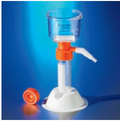
Tube Top Vacuum Systems