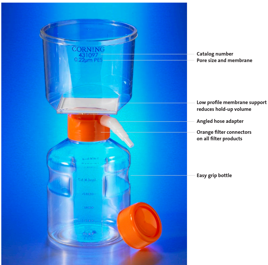
Corning® 500 mL filtration system with funnel and a 1,000 mL receiver bottle (Cat. No. 431097)

*1L Filtration System Benchmark Average Liquid Retention (n = 6).