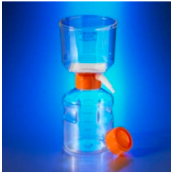
Vacuum Filtration Systems