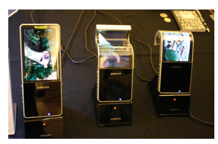
FLEXIBLE OLED DISPLAYS COULD SIGNAL THE END OF THE USE OF RIGID SHEETS OF GLASS TO ENCAPSULATE A SCREEN

'The advantages of flexibility are really felt in bigger displays. The iPad is quite heavy, for instance: it would be a benefit to customers to have a lighter display in a tablet,' Feenstra notes. +