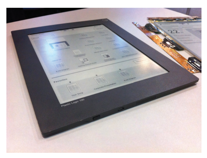
THE PLASTIC LOGIC 100 USES A FLEXIBLE BACKPLANE TECHNOLOGY FOR ITS E-READER DISPLAY

The Plastic Logic 100 e-reader for the education markets, boasts a flexible organic semiconductor backplane to