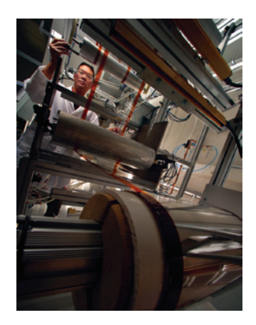
CORNING GLASS BEING PRODUCED IN A ROLL-TO-ROLL PROCESS

Yet the move to flexible displays may not mean abandoning glass for polymerbased encapsulation. Contrary to conventional wisdom, New